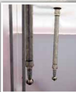
Inner 360° spinning nozzles. Water pressure moves the spinning head