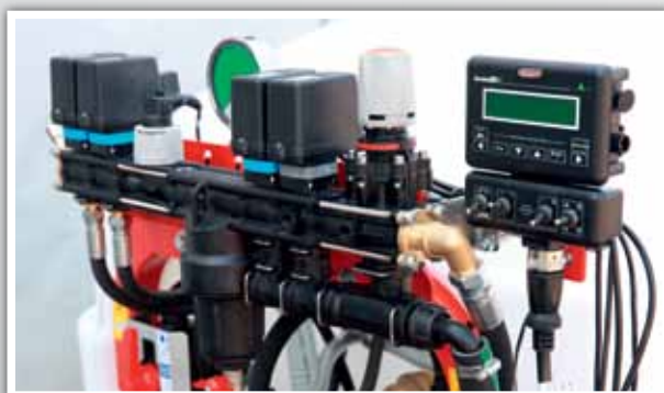
Electric control unit computer assisted

Valves and filters are all in easily accessible positions: a regular maintenance after every treatment improves quality of application and extends the life of the tools.